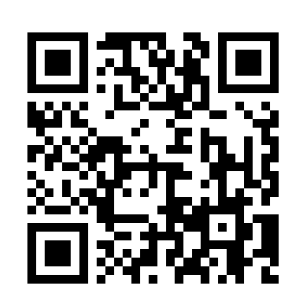
Volunteer at BHK