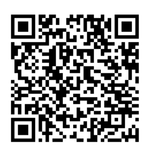
How to get Health Insurance